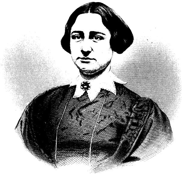
Antoinette L. Brown.